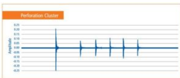
All detonations in a perforation cluster occurring within 2 minutes, as captured by Retina (pressure data removed for clarity).

Retina has monitored over 60 operations and more than 1,050 stages. The system provides a real-time, independent source of information for both pressure and non-pressure events.